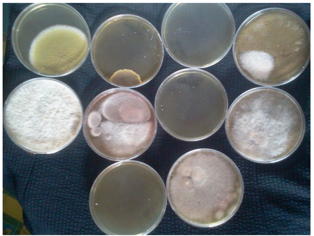
Plate 2: Isolates from Idepe maize samples