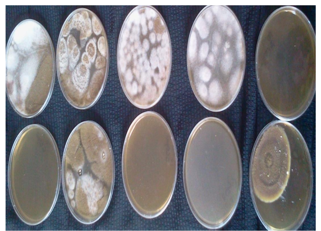
Plate 3: Isolates from Igodan-lisa maize samples