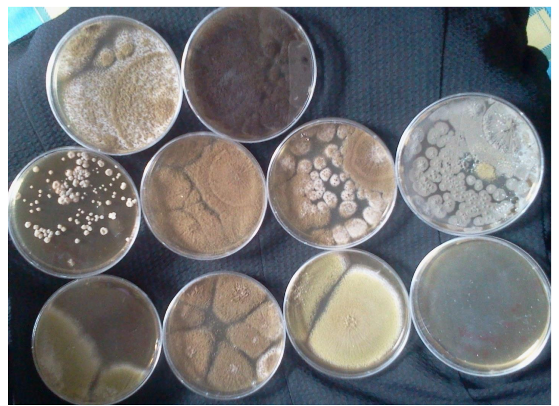
Plate 5 : Isolates from Ayeka maize samples