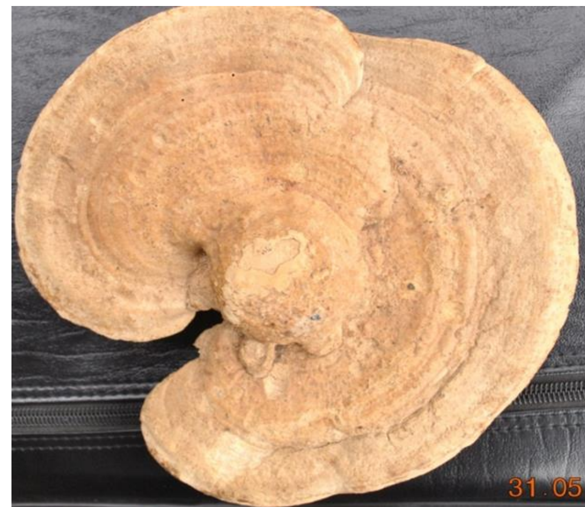
Plate 1: Photograph of fruiting body of Trametes species (front view)